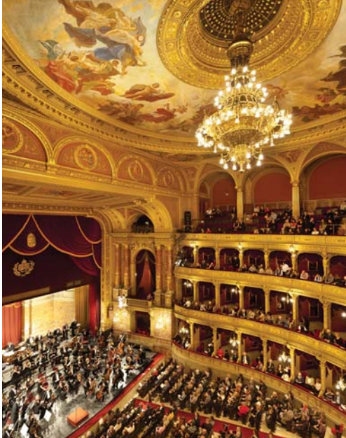
Budapest's State Opera House is considered one of architect Miklós Ybl's masterpieces and its acoustics are still among the best in the world.