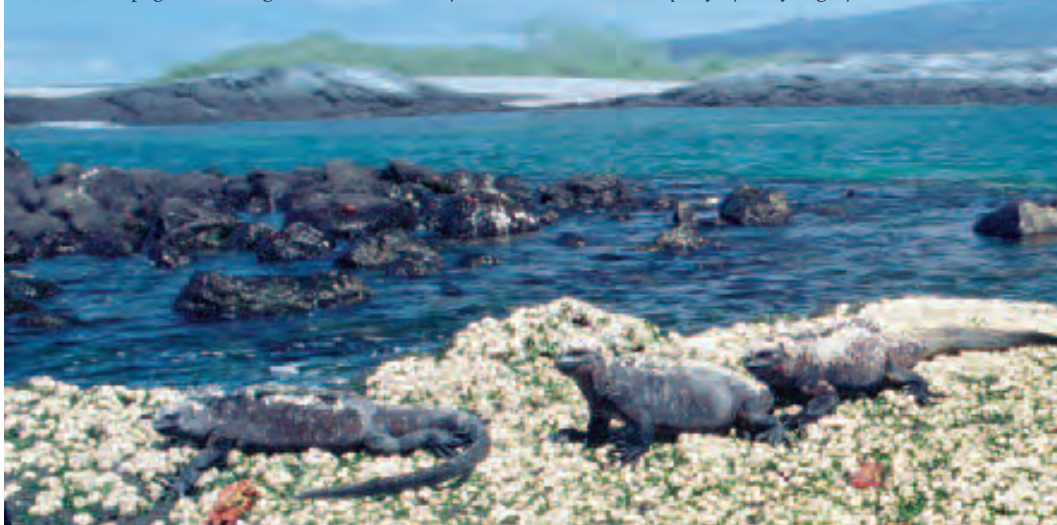
Photo this page: Marine iguanas bask in the afternoon sun in the company of Sally Lightfoot crabs.

Cover photo: Blue-footed boobies are a common sight along the rocky shores of the Galápagos, where they congregate to nest and mate.