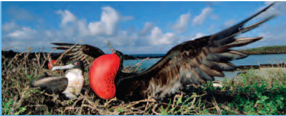
Look for the unusual mating “dance” of the magnificent frigate birds, one of the Galápagos Islands’ hallmark species.