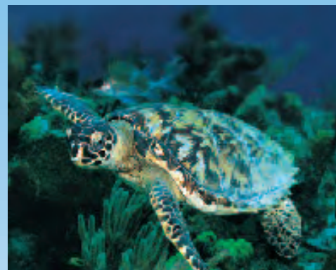
The graceful Pacific green sea turtle is the only marine turtle to nest regularly on Galápagos beaches.

Arrive this morning on the shores of San Cristóbal, the first Galápagos island Darwin landed on in 1835. Transfer to the airport and fly to Guayaquil. Invigorated by trade with the Far East, this city became one of the wealthiest on the continent, a status that made it a favoured haven for English and Dutch buccaneers in the 17th and 18th centuries. See the historic markets and shipyards; visit famous Bolivar Park, where playful iguanas scamper through its grounds; and stroll past historical and cultural monuments along the Malecón 2000 promenade overlooking the Guayas River. Check into the deluxe HILTON COLÓN HOTEL and join your travelling companions for a farewell reception.