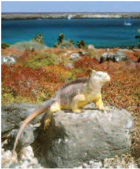
Observe, as Charles Darwin did more than 150 years ago, the distinct creatures indigenous to the Galápagos Islands, like this land iguana.