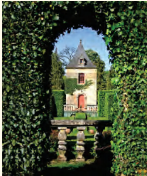
Cover photo: Explore this mediaeval region of Dordogne, where street lamps are one of the few concessions to modernity.