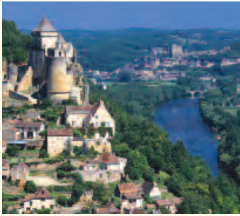
Cruise through the storied Dordogne River Valley and gaze at mediaeval monuments once defended by knights.