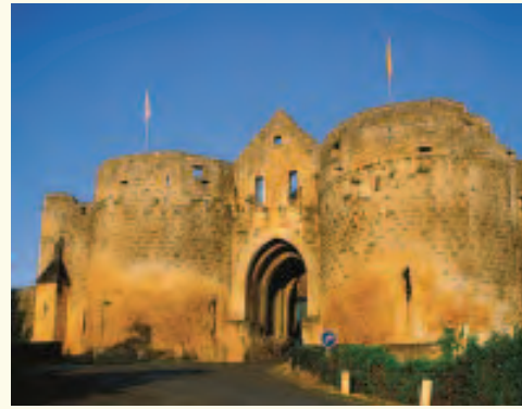
Porte des Tours is the best preserved and most imposing of the three remaining original entrances to Domme.

Designated a national monument by the French government, Eyrignac Manor has