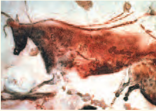
Marvel at the exquisite artistry and ingenuity of prehistoric painters in Lascaux II, an exact replica of the UNESCO World Heritage site.