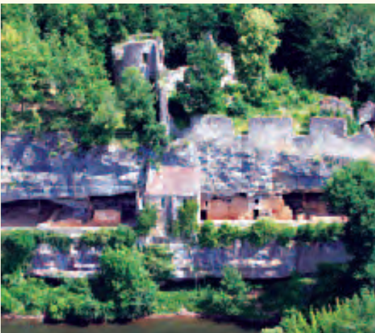
The River Vézère links the caves of Lascaux with the troglodyte village of La Madeleine, a prehistoric settlement.

Nearby, outside the village of Les Eyzies, visit the original rock shelter and UNESCO World Heritage site of L'Abri du Cap-Blanc showcasing the rare, life-size frieze of horses and bison sculpted in limestone. A guided tour of the exhibits at the National Museum of Prehistory in Les Eyzies helps put this vast network of prehistoric art into context.