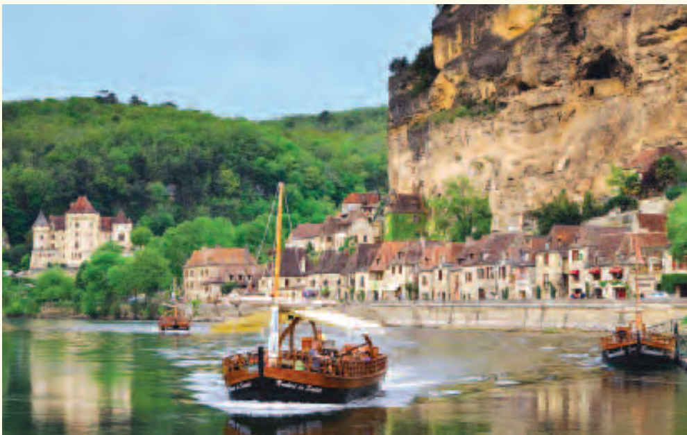
Sail the bucolic Dordogne River aboard a traditional wooden gabare, the typical mode of transportation of the Périgord region for more than 150 years.