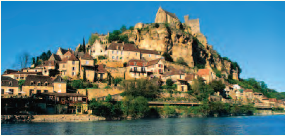
Visit the Château de Beynac , which soars dramatically above the Dordogne River Valley. Once a stronghold of Richard the Lionheart, it remained a highly prized strategic outpost for centuries.