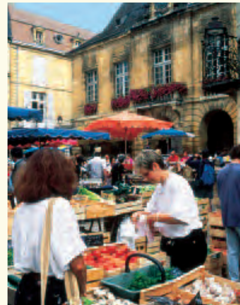
Experience Sarlat-la-Canéda's twice-weekly market, a mediaeval tradition in the heart of the village.

Carved beneath a cliff overlooking the picturesque Vézère River, the prehistoric troglodyte village and UNESCO World Heritage site of La Madeleine offers