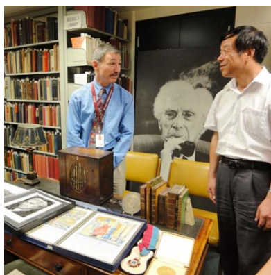
Bertrand Russell Archives

Activities outside the classroom are arranged so that participants have opportunities to apply their new English skills and knowledge. The English Teachers Training Program focuses on improving teachers' English language abilities in the context of English language, literature and culture. Additionally, teachers will be trained in teaching methodology to aid them in becoming more efficient and effective English teachers in their home-country educational institutions. The program is taught by highly qualified and experienced instructors with access to the superb facilities provided by a world-class university.